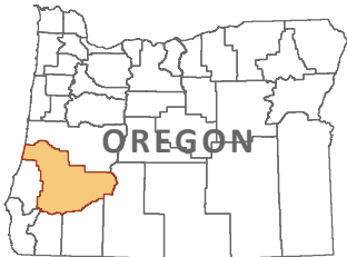
Study Location Map

This map is an overview map and not intended to provide details at the community scale. The GIS data that are published with the Douglas County Multi-Hazard Risk Assessment can be used to inform regarding queries at the community scale.